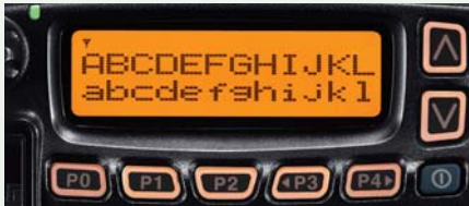
Two line setting display example.

With a high contrast dot matrix display, upper and lower case characters can be easily distinguished. You can change the display setting to show one line and 12 characters, or two lines and 24 characters via programming. LCD backlighting is useful for night time operation.